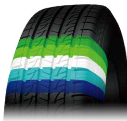
Image of five-pitch variation

A five-pitch variation reduces disturbing noise, which interrupts a comfortable driving experience.